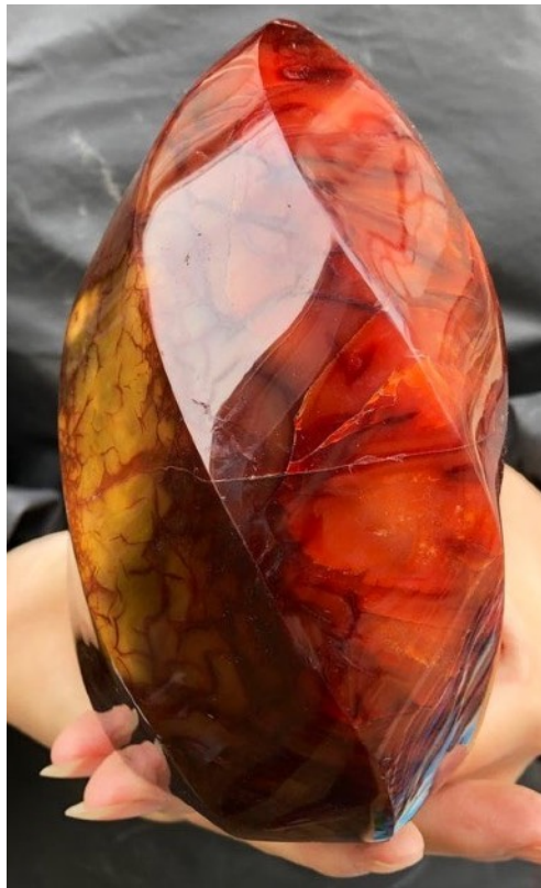
Carnelian Jasper flame quartz